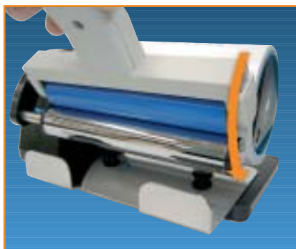
Pushing down on the lever support roller rotates the adhesive roll.