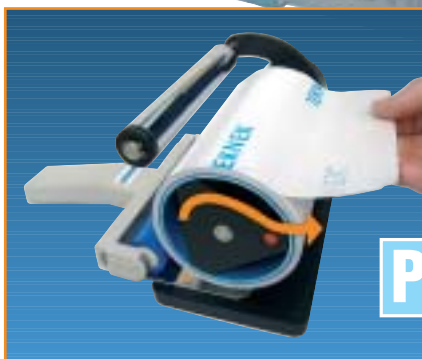
Pre-sheeted adhesive roll for easy removal of contaminated sheet.