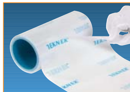
Pre-cut sheet – no knives required.

The DCR Mate can be used horizontally on a work top or mounted for vertical use. The DCR Mate is also suitable for Class 100 clean room applications and removes the need to tear off paper pads that other systems require. This prevents extra paper dust being introduced in the clean environment. New adhesive rolls can be simply and quickly fitted onto the system for the next period of use.