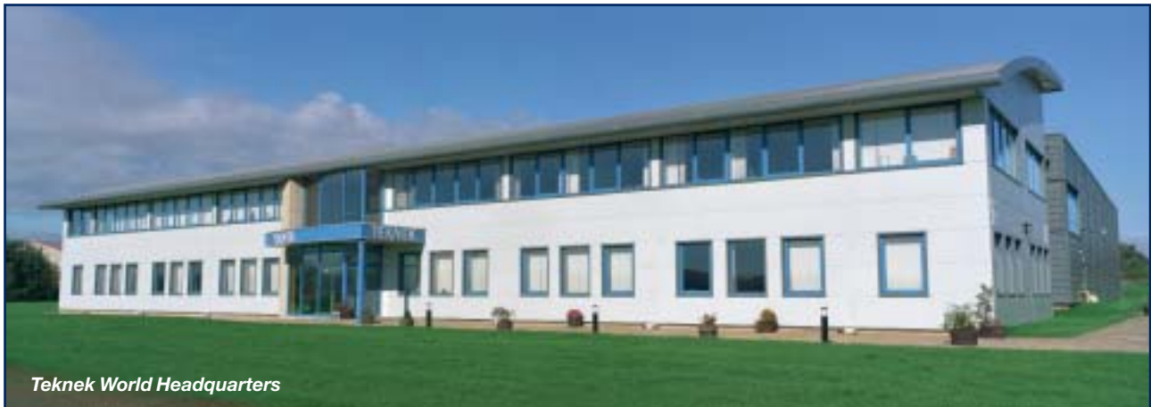
Teknek World Headquarters

Established in 1984, Teknek are the first and most innovative provider of cleaning solutions world-wide. Teknek's commitment to innovation and quality means continuous investment in cleaning technology with an R&D department, in-house roller manufacture and an advanced computer business system for fully integrated manufacturing. With over 180 staff, based at our 9 sites world-wide, supporting our 90 plus distributors and over 12000 installations of Teknek Clean Machine technology world-wide, Teknek are the undisputed world leader in contact cleaning.